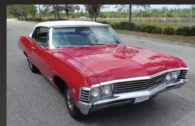
1967 CHEVROLET IMPALA SS