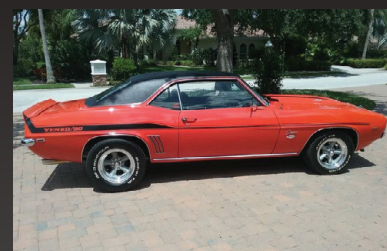
1969 CHEVROLET CAMARO