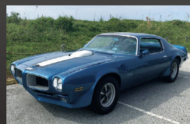
1970 PONTIAC FIREBIRD TRANS AM