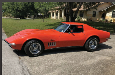
1969 CHEVROLET CORVETTE