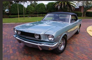
1965 FORD MUSTANG