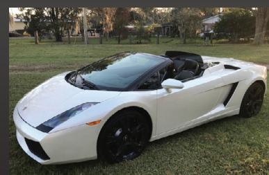
2008 LAMBORGHINI GALLARDO

SEE 400+ CONSIGNMENTS ONLINE: CARLISLEAUCTIONS.COM